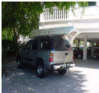
Yole can be car topped.