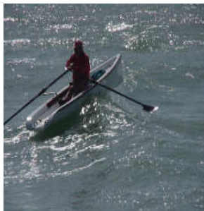
Yole single in open water, stable and dry rowing